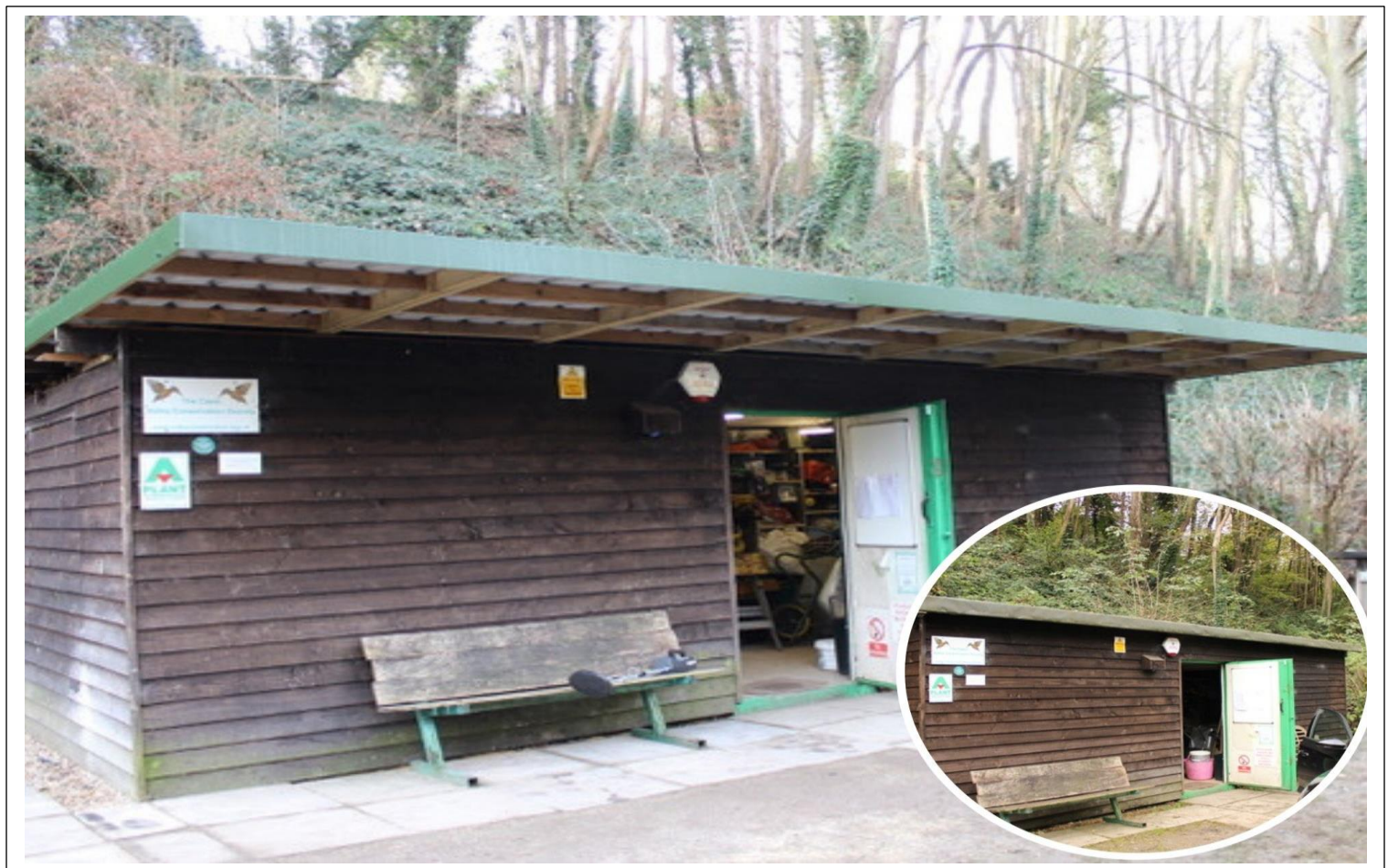
The cabin today, and (insert) before

The opportunity was taken to effect some improvements to the design, including the extension of the roof to create an overhang, so that the work party can have some shelter to eat their sandwiches under when it is raining.